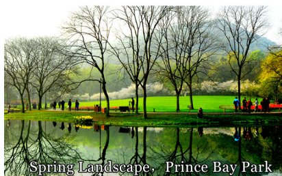
Spring Landscape, Prince Bay Park