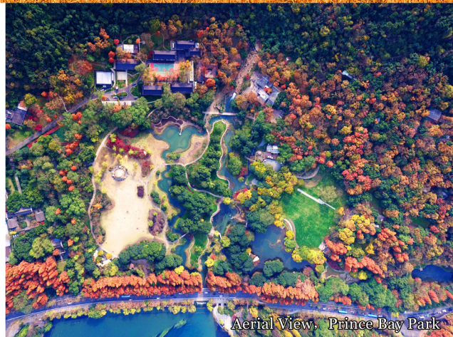
Aerial View, Prince Bay Park

↑ By changing the form and line shape of the West Lake diversion canal, Prince Bay Park forms a spectacular waterfall landscape through the Nanpingshan Mountain, and finally injects into the West Lake through the central bay of the park.