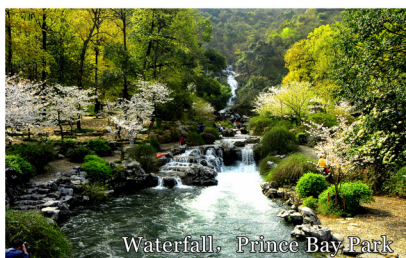
Waterfall, Prince Bay Park